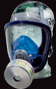
MSA Advantage 3100