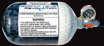
Biomarine Spare Oxygen