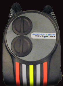
Biomarine Biopak 240 Revolution