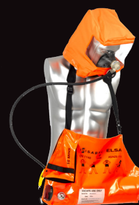
Scott Safety Elsa 15 Minute Escape Set