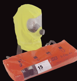
MSA S-CAP Complete 15 Minute Duration