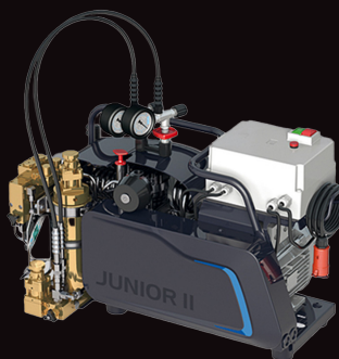
Bauer Junior II