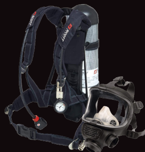
Scott Safety ProPak