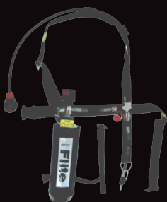
Scott Safety Flite