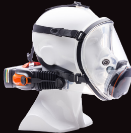
CleanSpace Ultra Full Mask