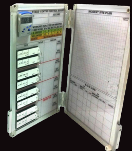
BA Tally Board