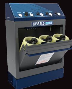
Bauer Containment Fill Station