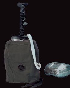
MSA SSR 30/100