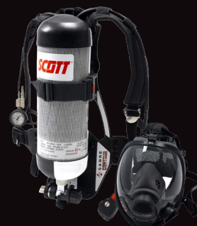
Scott Safety Contour