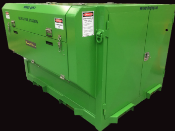
Quick Fill Station