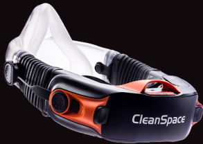
CleanSpace Ultra Half Mask