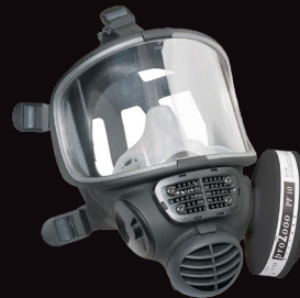
Scott Safety P3