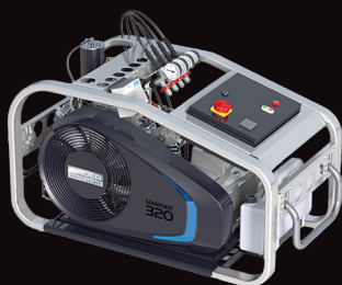
Bauer Mariner 320